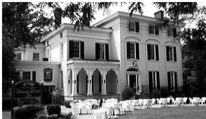
The Alexander Hamilton Inn, home of the Alexander Hamilton Institute.